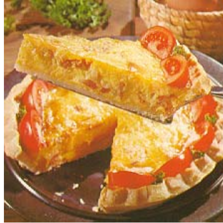
egg & bacon flan