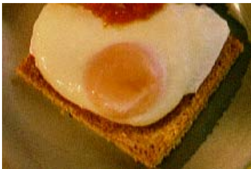
egg on toast